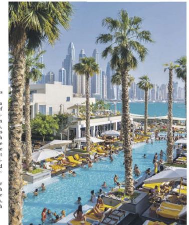
A social pool at Five Palm Jumeirah

Dubbed Dubai's hottest lifestyle hotels Holiday like a VIP and enjoy exclusive access to Dubai's most bespoke dining venues, beach and live entertainment events. Dine, drink and dance at Five's experiential dining venues, a selection of unique dining concepts offering artisan drinks, bold flavours and electric atmospheres that invite you to socialise and dance the night away.