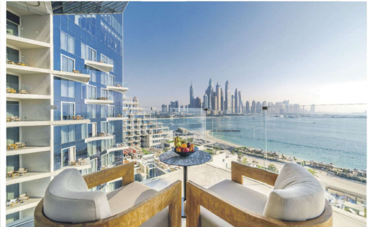
A luxury sea view room boasting Marina skyline views at Five Palm Jumeirah

DJ on the weekends, or take a dip in the Insta-famous social pool, home to Dubai's best pool parties and the beating heart of the hotel.