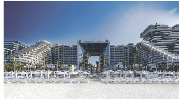
A luxury beach resort Five Palm Jumeirah

spotting and to dine, drink and dance until the early hours with the world's best DJs taking the decks in its indoor city side nightclub terrace. From award-winning ladies' night to a high-energy Friday brunch and a fun-packed calendar of live entertainment events, there's something for everyone every day of the week — after all, Five knows how to throw a party with a bang. From daytime to nighttime, hit the glamorous 150-metre private beach with live