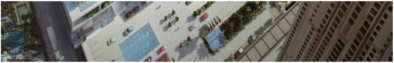
Five Beach is set to open in JBR in 2023.