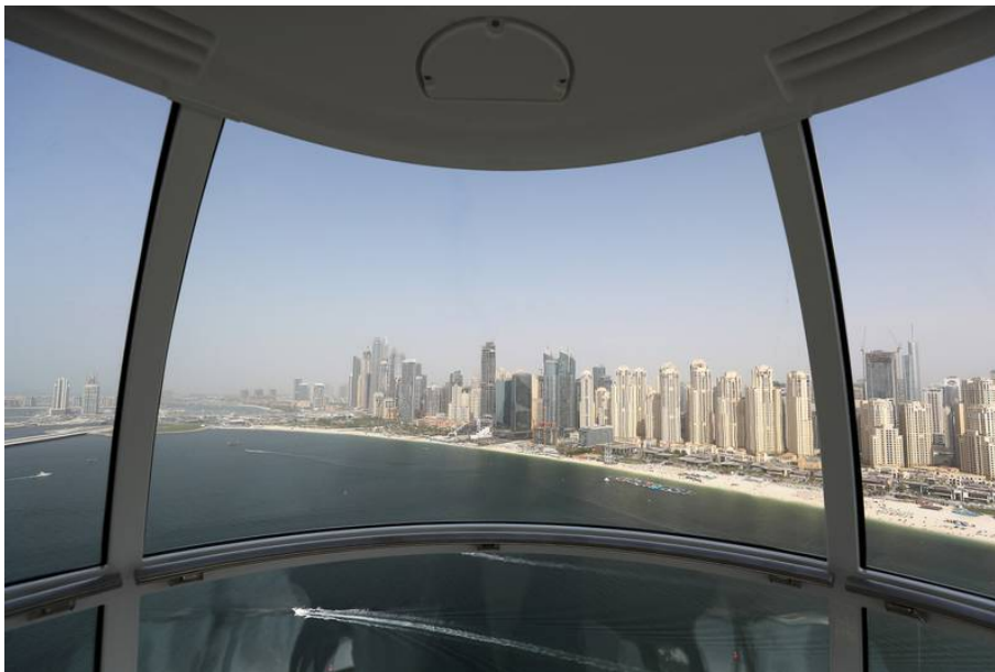
Ain Dubai will open to the public on October 21.

It will be the Five portfolio's third hotel in the emirate, alongside Five Palm Jumeirah and Five Jumeirah Village, and fourth hotel in total when Five Zurich opens its doors in 2022.