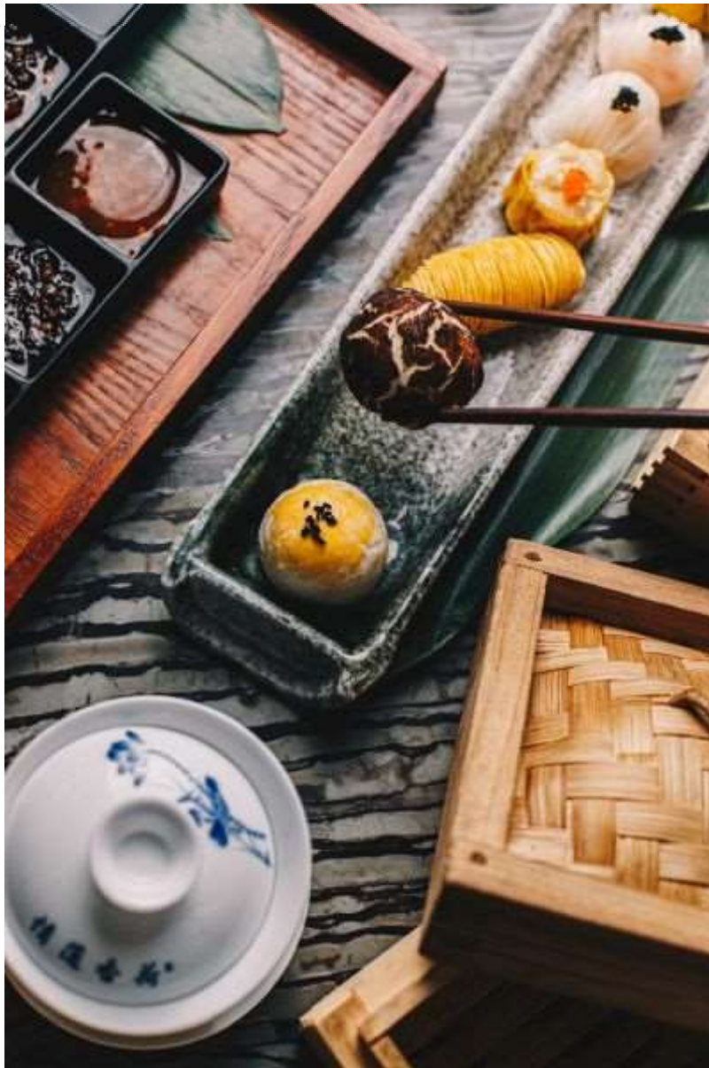
Starters include an array of moreish dim sum

All the while, staff circle to make sure your glass is never empty, be it bubbles, grape, hops, or one of the six unique and playfully named mixed drinks (think Ruby Red and Bob-Licious). The signature serve, the fruity Naughty Noodles, is drunk straight from a noodle carton – emulating the playful persona of the FIVE brand. In between courses, guests can sit back and enjoy the view, be it out of the soaring glass windows or on the sun-soaked terrace.