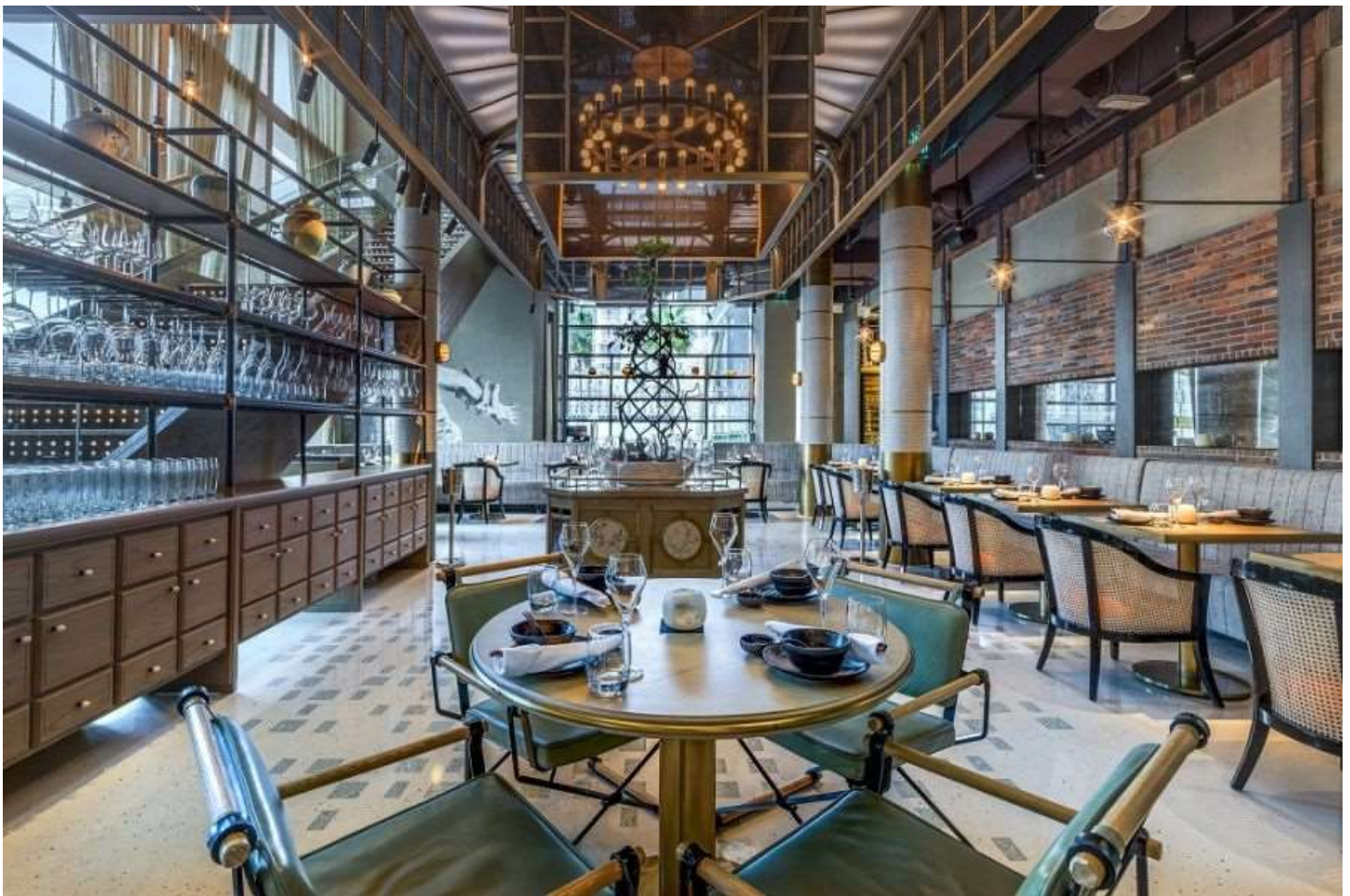
Maiden Shanghai offers both cool indoor seating and a sun-soaked terrace

The oriental theme continues to the cuisine, and guests are treated to a three-hour feast of unlimited Chinese classics and moreish FIVE creations. All guests receive a fruity mixed drink on arrival, whets the appetite for the onslaught of fresh and zingy dishes to come, most of which are gluten-free and organic. All are MSG-free. For those looking to make the most of the picturesque setting, there's even free-flowing Laurent Perrier for one hour – along with house bubbles and the usual beverage options throughout the brunch.